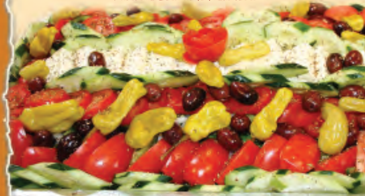
Greek Salad For Groups

VIEW OUR FULL CATERING MENU ONLINE: VILLAGEPIZZA.NET