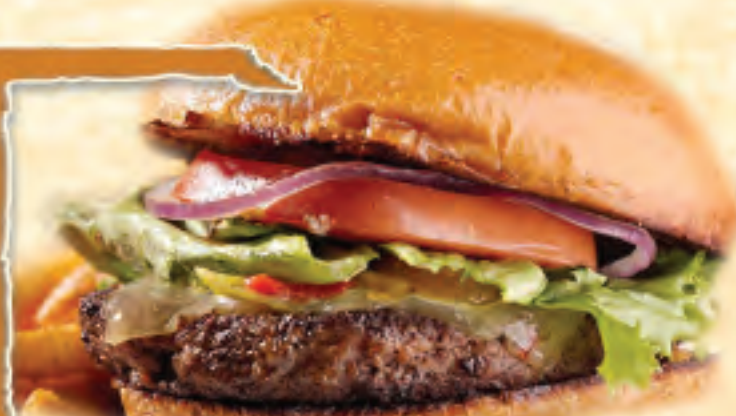
Black Angus Hand Pressed on Premises

Turkey Breast Real turkey breast roasted on the premises