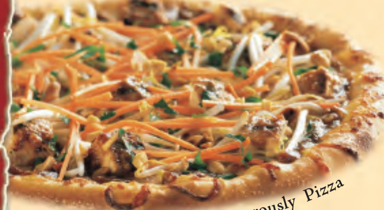
Bangkok Dangerously Pizza