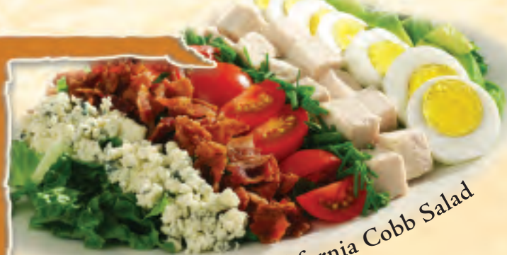
California Cobb Salad