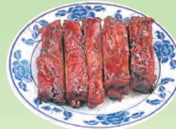
BBQ Spare Ribs

We Can Alter The Spice According to Your Taste