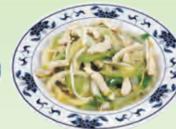
Chicken Chow Mein