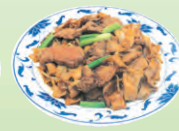
Beef Chow Fun