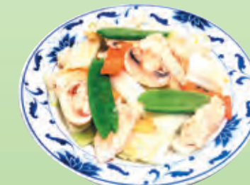
Moo Goo Gai Pan