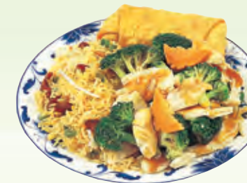
Chicken Broccoli Combo