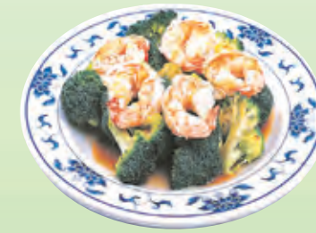
Shrimp w. Broccoli