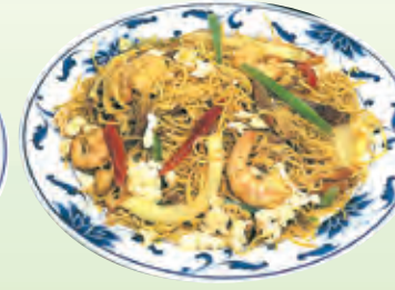
Singapore Mai Fun