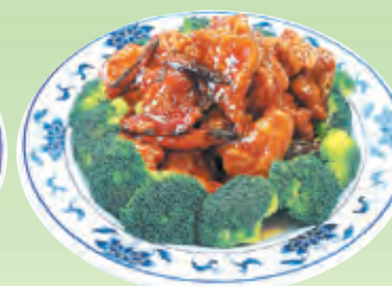
General Tso's Chicken