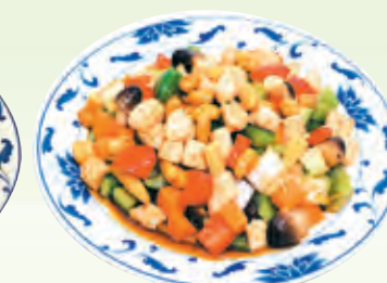
Kung Pao Chicken