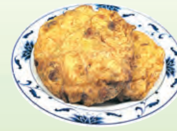
Egg Foo Young