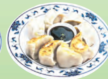
Steamed or Fried Dumpling