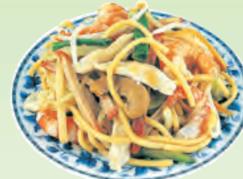
House Special Lo Mein